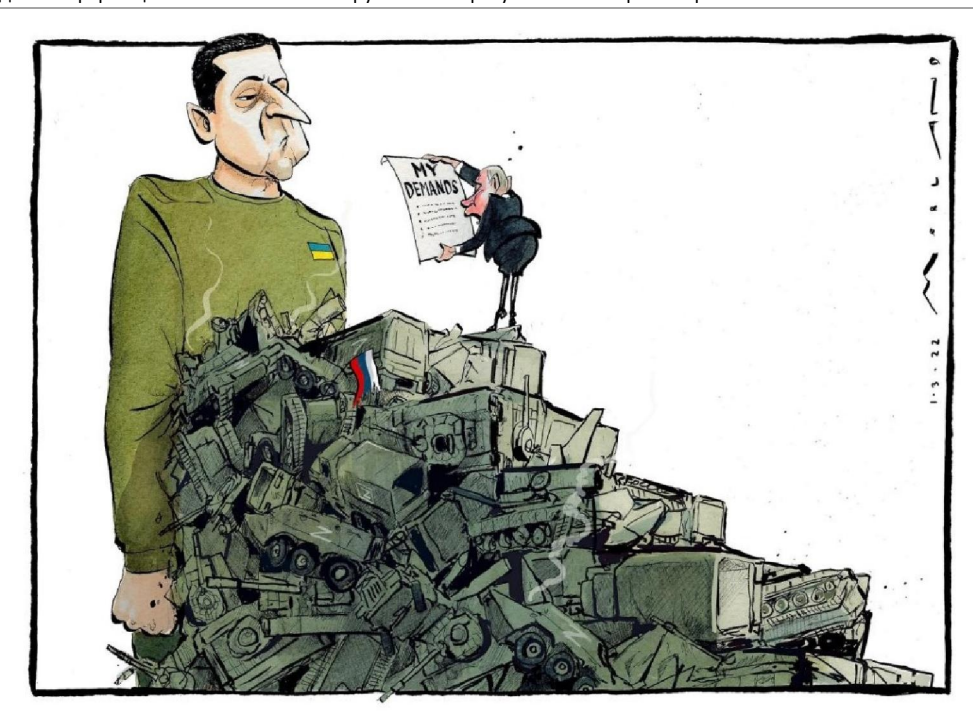
Caricature №4. Morten Morland, "My demands", The Times, 2022, March 01