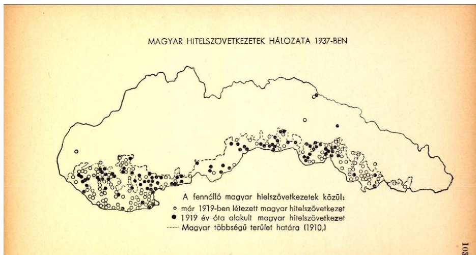
Fig. 1. The map "Twenty years of Hungarians in Upper Hungary 1918-1938" (A felvidéki magyarság húsz éve 1918-1938 (Budapest. Királyi Magyar Egyetemi Nyomda, 1938) 5 .

According to publishers of Uzhgorod, Hungary continued a significant violation of the geopolitical balance in Europe by its expansionist actions. The change in the borders of the Czech Socialist Republic resulted in stepping-up of the territorial claims and ethnically based revision on the part of Hungary too, which had been seeking to revise the Treaty of Trianon of 1920 throughout the interwar period. Yet on September 22, 1938, the Hungarian Foreign Ministry sent a note to the Czechoslovak government, which demanded the transfer of the Czechoslovak territories, inhabited by the Hungarians, and granting them the right to self-determination.