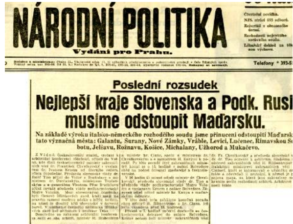
Fig. 2. Title pages of the publications "Narodna Politika" and "Nova Svoboda" with the headlines regarding new borders of Subcarpathian Ruthenia.

On October 16, 1938, at the Great Demonstration Meeting of the Ukrainian People's Council, A. Voloshyn as a representative of the government of its Ukrainophilia current called on all Ukrainian community to declare their unwillingness to join Hungary, "where we were slaves, manure of Magyars" ( Ternystyi shliakh do Ukrainy, 2007: 145 ), through telegraphic approval to the great states. It was interesting that, showing the statist consciousness, the regional representative body (the First Ukrainian Central People's Council) in a situation of extreme conflict with its southern neighbor, in the Manifesto of October 21, demanded from Prague "to ensure the present borders against Magyaria and to consolidate the whole Zemplynshchyna and Šarišský and Spišské regions with our population to Subcarpathia" ( Grenzha-Donskii, 2003: 315-317 ).